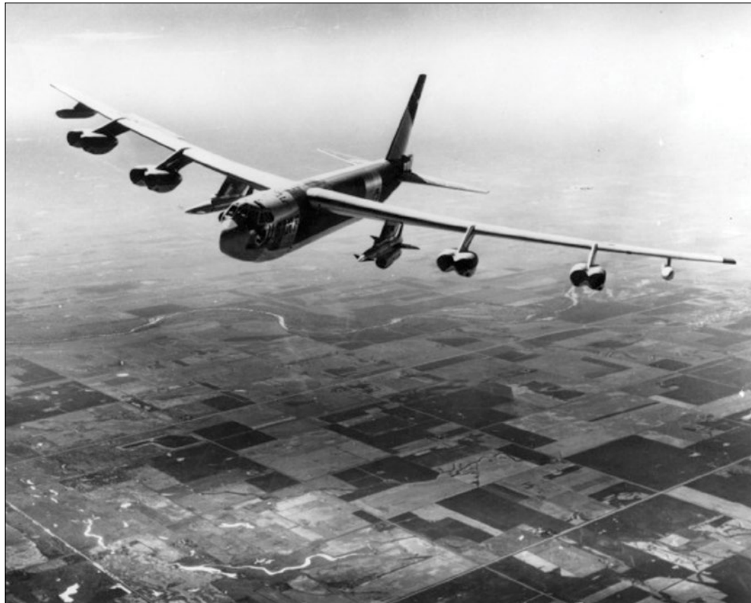
© AV8 Collection 2/Alamy Stock Photo, Image ID ENC9UG

This map depicts the northern Chrome Dome B-52 routes with communications check-in points. Six pairs of B-52 bombers each equipped with six nuclear weapons flew this route in a counter-clockwise direction daily. The dog leg to the west over Alaska placed the aircraft within cruise missile range of Ugol'nyy and its facilities.