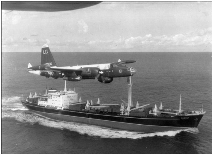
In 1962, a US Lockheed P2V Neptune patrol aircraft overflies a Soviet freighter during the Cuban missile crisis.