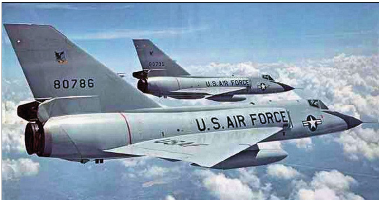
Two Convair F-106 Delta Dart fighter interceptors of the United States Air Force

Other large airfields in the region that might act as refuges for SAC's bombers or NORAD interceptor aircraft would likely be attacked: Vancouver, for example, was a candidate because of the presence of RCAF Sea Island (now the site of Vancouver International Airport) and its large runway, and its reserve F-86 Sabre fighter squadron. Free fall bombs in the megaton yield range directed at Esquimalt and Sea Island would have destroyed Victoria and devastated Vancouver.