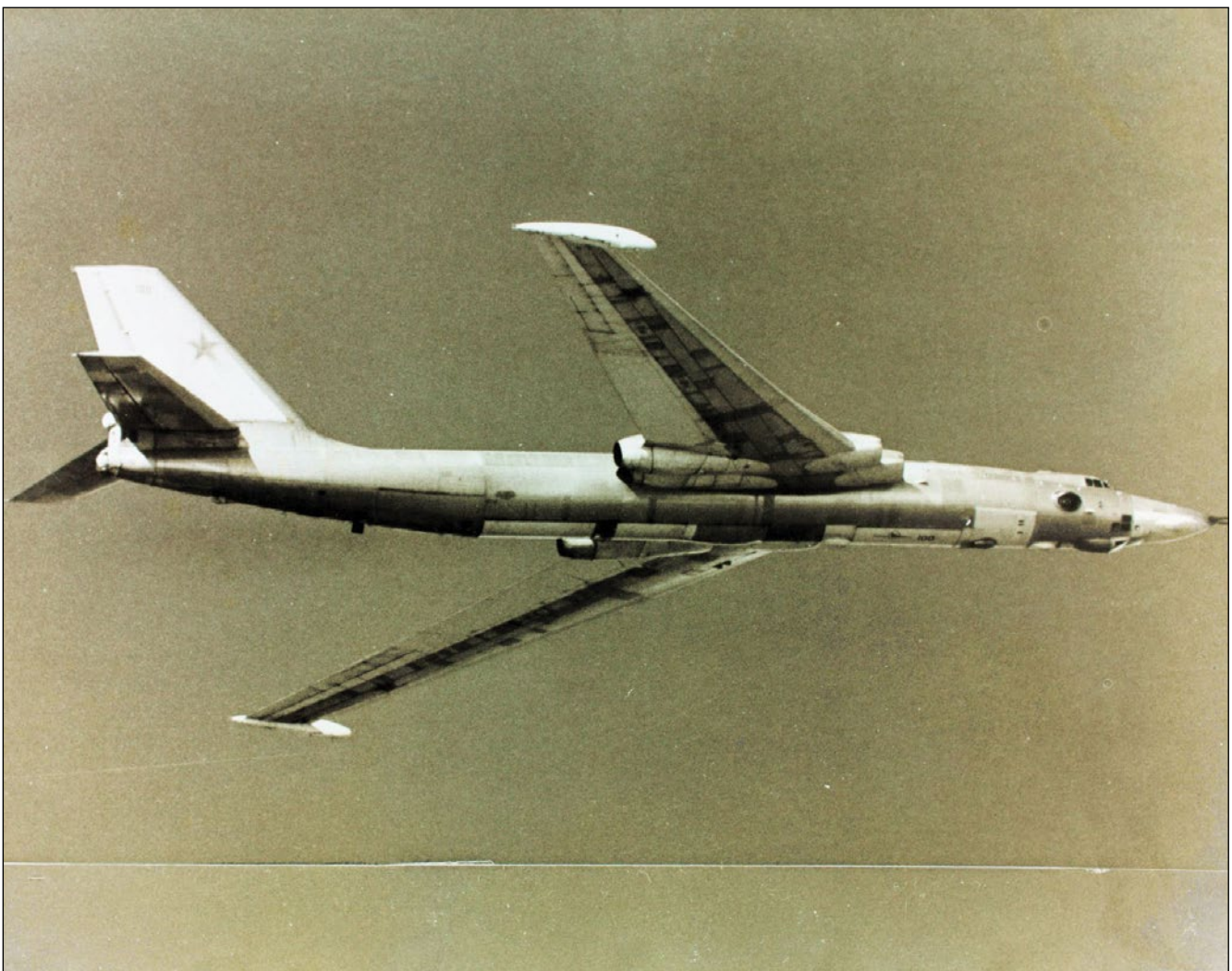
A Myasishchev M-4 (Mya-4) Bison