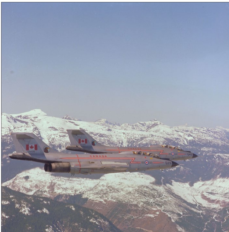
DND/CFJC photo CXG77-1944

“The same study provides a cogent discussion with respect to Soviet nuclear strategy. In effect, there were three choices: retaliation; first strike; and pre-emption.”