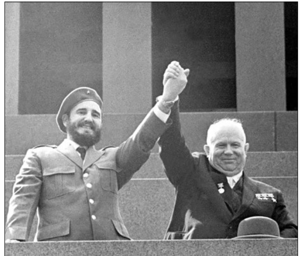
Fidel Castro and Nikita Khrushchev, 1962