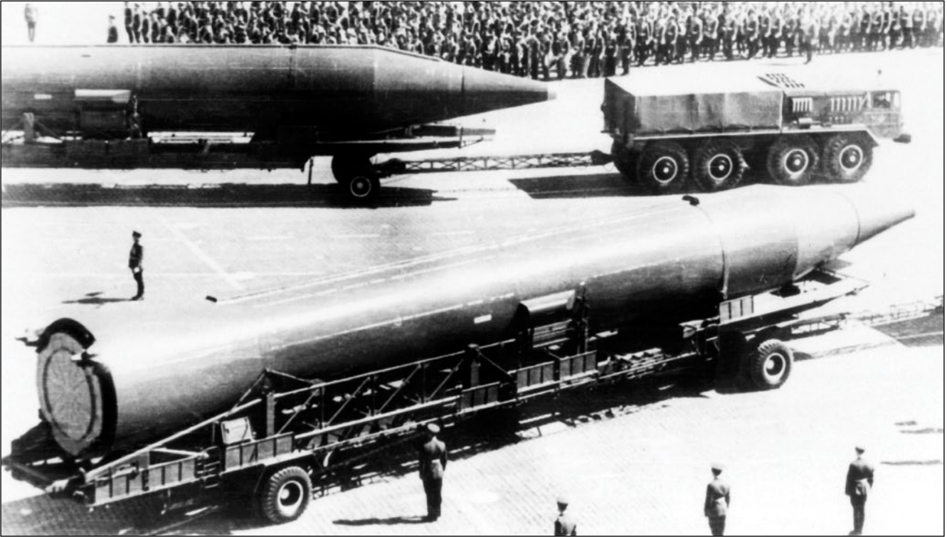
US Defense Imagery, photo DF-SN-83-01207

A right side view of two vehicle-mounted Soviet SS-5 Slean medium range ballistic missiles