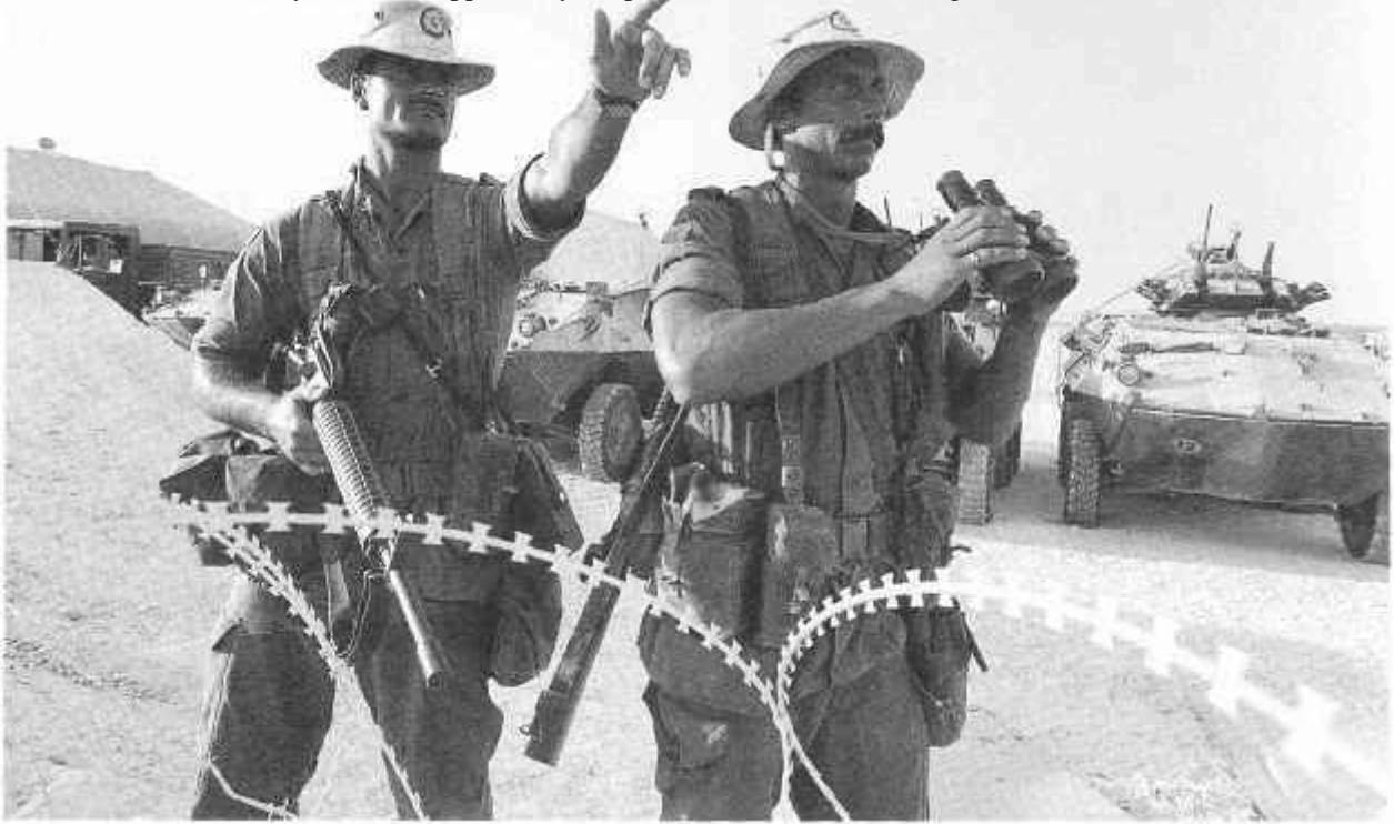
Two soldiers from 3rd Battalion Royal Canadian Regiment on patrol at Canada Dry 2 in Qatar. (CFPUSC 90-5050)

As the Canadian naval task group departed on 24 August for its "Persian Excursion," the first U.S. pre-positioning ships from Diego Garcia disgorged enough equipment for two U.S. Marine Corps divisions. By 25 August, the U.N. passed Resolution 665, which permitted the use of military force to back up the economic sanctions against Iraq.