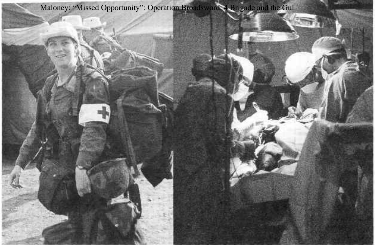
Above left: Canadian medical personnel arrive in Saudi Arabia; Above right: Canadian doctors perform surgery on an Iraqi prisoner of war.

of the large RO/RO (Roll on/Roll off) Newfoundland ferries was contemplated, but this was not feasible for political reasons. Moving manpower was less of a problem; agreements between the Canadian Government and commercial air carriers in Canada ensured Canada's ability to move troops and some light equipment. The apparent lack of heavy lift would probably have imposed a significant time delay on the deployment of 4 CMBG if BROADSWORD were authorized and implemented.