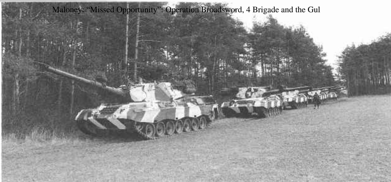
Leopard Is of 4 Canadian Mechanized Brigade on exercise in Germany.