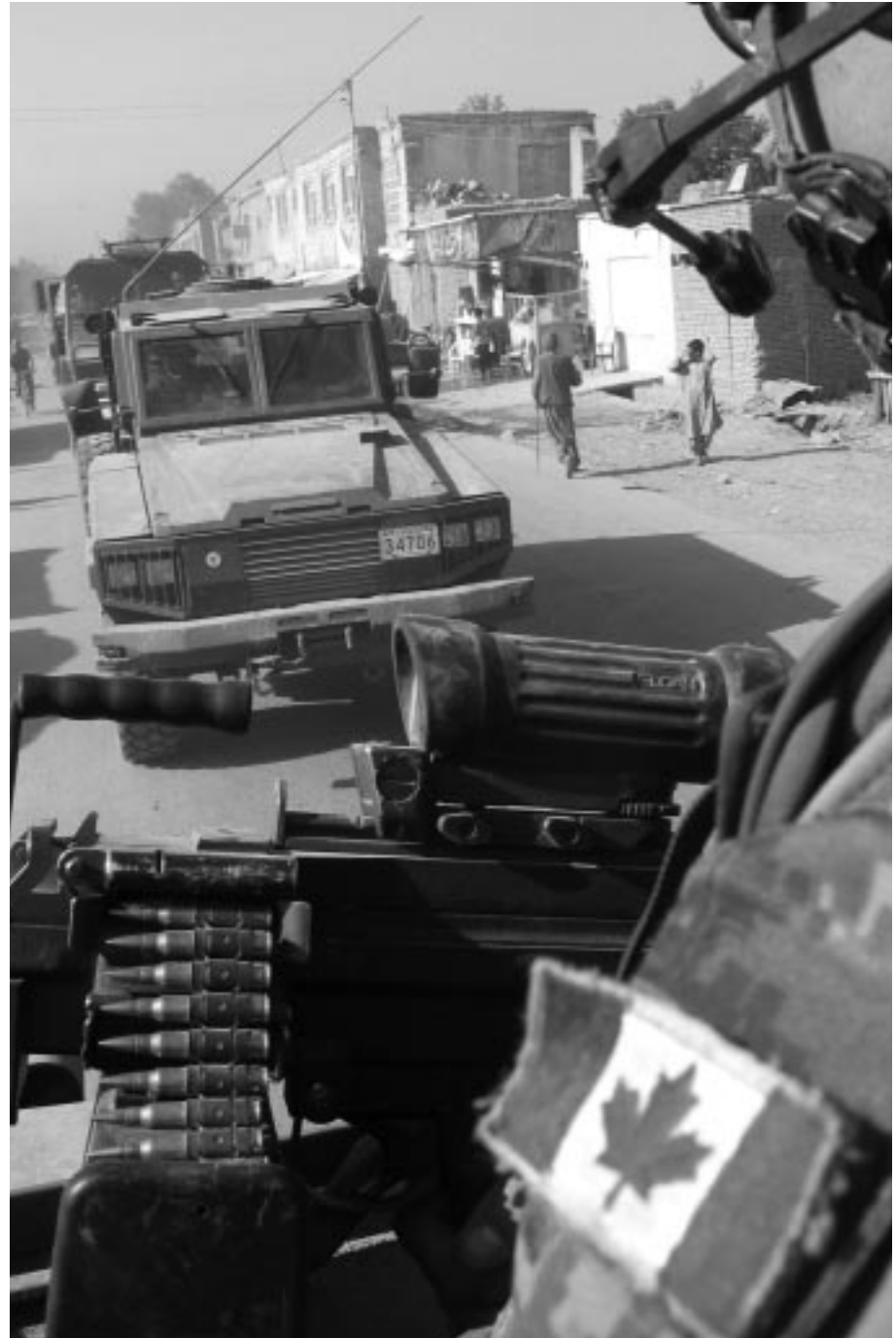
Frank Hudec, Canadian Forces

stalled. The NATO expansion plan, established after the Istanbul Summit in June 2004, divided Afghanistan into four zones: north, west, east, and south. OEF already had PRTs in all four zones. In principle, NATO ISAF was to replace OEF in the northern sector and, over