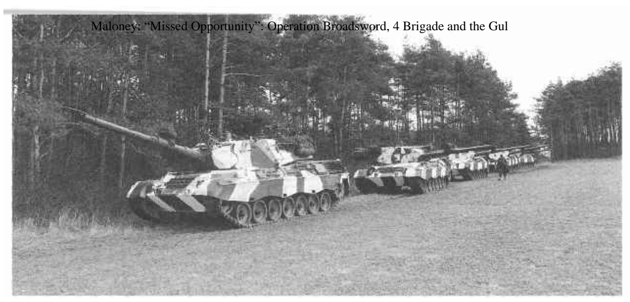
Leopard Is of 4 Canadian Mechanized Brigade on exercise in Germany.