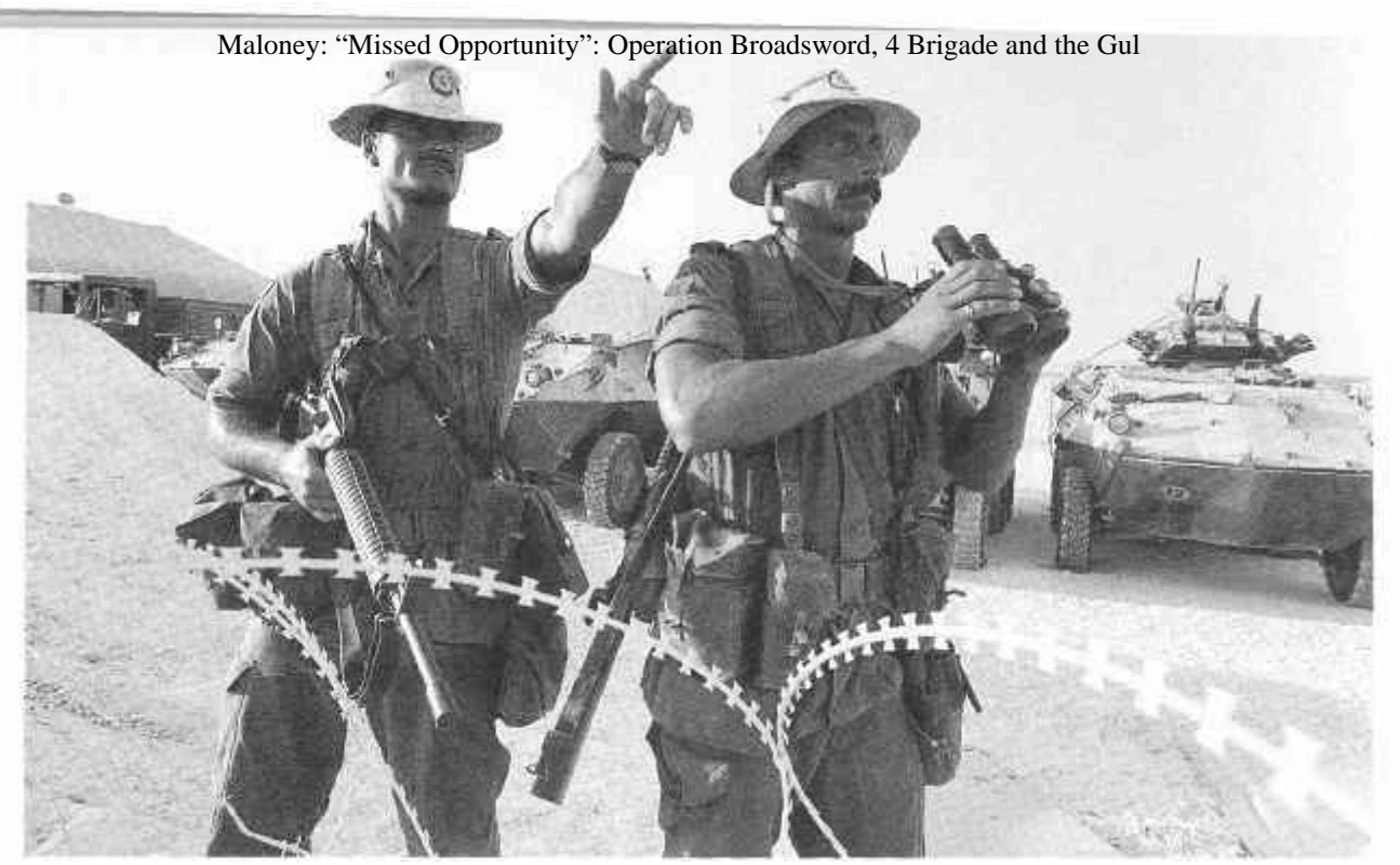
Two soldiers from 3rd Battalion Royal Canadian Regiment on patrol at Canada Dry 2 in Qatar. (CFPUISC 90-5050)

As the Canadian naval task group departed on 24 August for its "Persian Excursion," the first U.S. pre-positioning ships from Diego Garcia disgorged enough equipment for two U.S. Marine Corps divisions. By 25 August, the U.N. passed Resolution 665, which permitted the use of military force to back up the economic sanctions against Iraq.