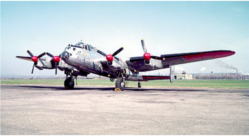
CF photo RT 112